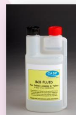
1 x BCB - Bubble Wall Additive