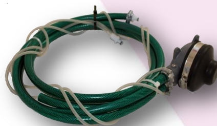
1 x Bubble Wall Emptying Kit with foot pump