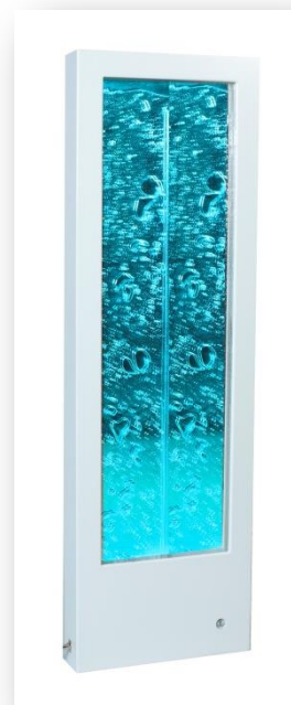
1 x Calming LED Bubble Wall