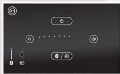
1 x Bluetooth Amplifier