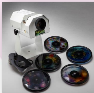
1 x Aurora LED Projector Bundle