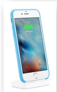
1 x iPod Dock