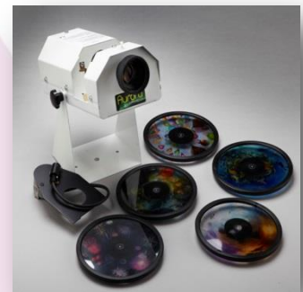
1 x Aurora LED Projector Bundle