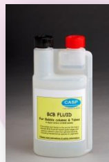
1 x BCB - Bubble Tube Additive