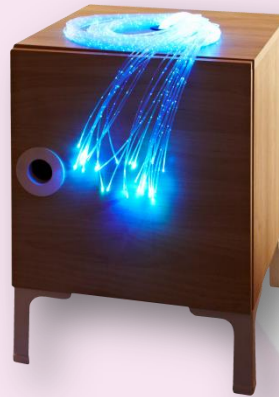
1 x Bedside Cabinet – Fibre Optic Strands (style and colour may vary)