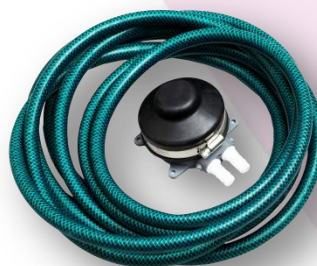
1 x Bubble Tube Emptying Kit with foot pump