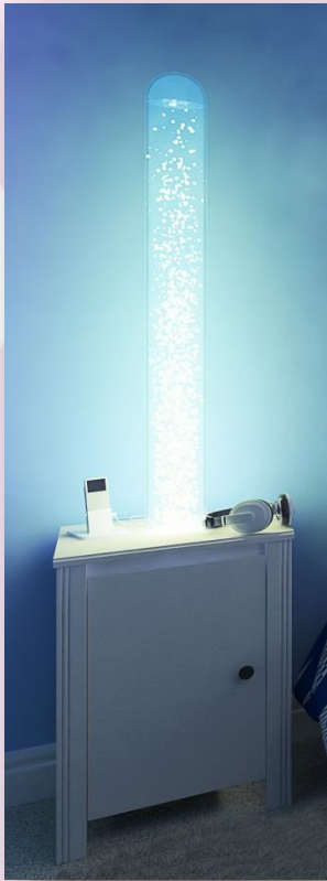
1 x Bedside Cabinet – Bubble Tube (style may vary)