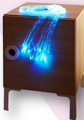
1 x Bedside Cabinet – Fibre Optic Strands (colour and style may vary)