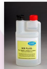
1 x BCB - Bubble Tube Additive