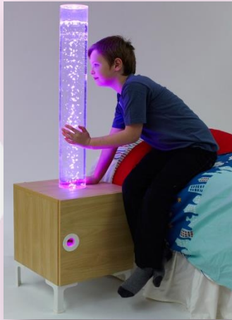
1 x Bedside Cabinet – Bubble Tube (colour and style may vary)