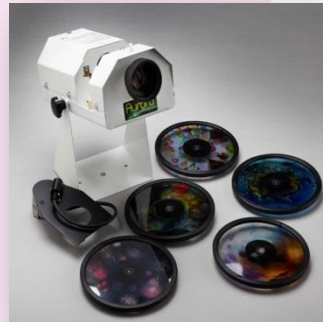
1 x Aurora LED Projector Bundle