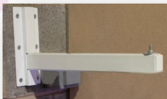
1 x Wall Bracket