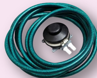
1 x Bubble Tube Emptying Kit with foot pump