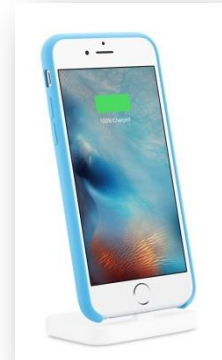
1 x iPod Dock