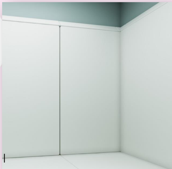
Soft Wall Padding (quantity as per your room size, survey may be required)