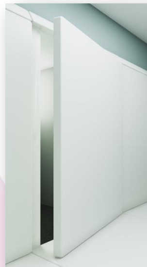
1 x Soft Door Padding (quantity as per your room size, survey may be required)