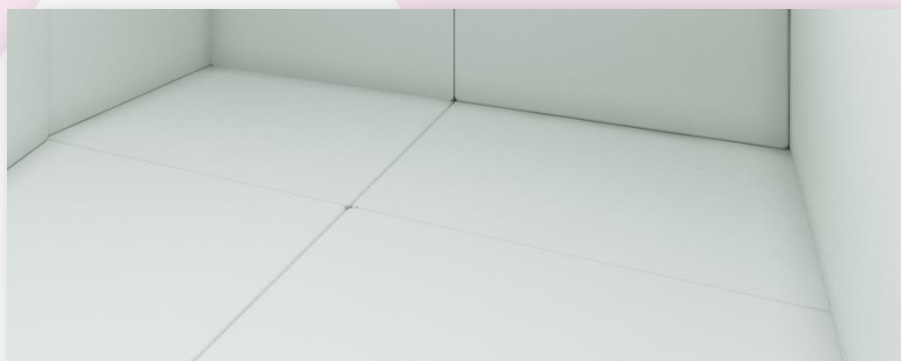
1 x Soft Floor Padding (quantity as per your room size, survey may be required)