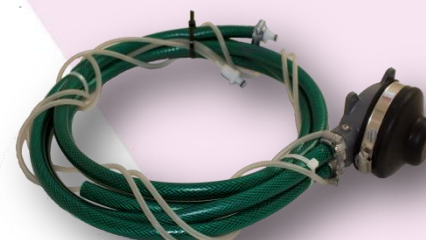
1 x Bubble Wall Emptying Kit with footpump