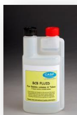
1 x BCB Bubble Wall Additive