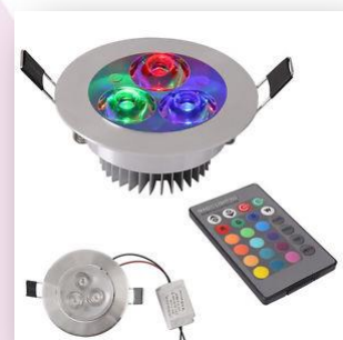
4 x Calming LED Recessed Spots and Controller (recessed if ceiling allows, controller may vary)