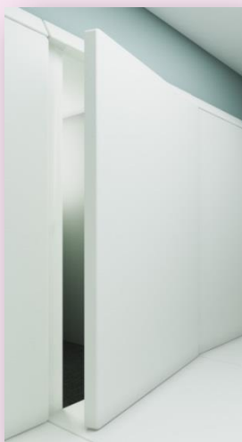
1 x Soft Door Padding (quantity as per your room size, survey may be required)