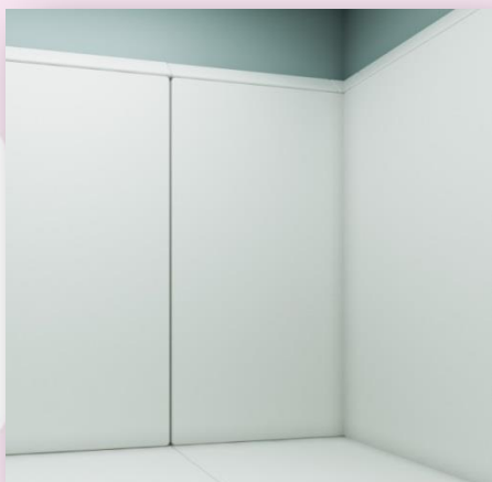
Soft Wall Padding (quantity as per your room size, survey may be required)