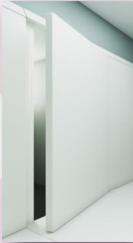
1 x Soft Door Padding (quantity as per your room size, survey may be required)