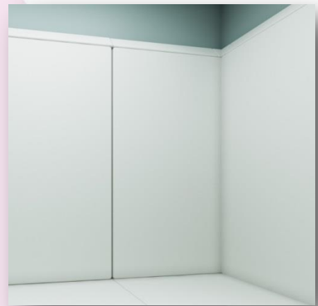
Soft Wall Padding (quantity as per your room size, survey may be required)