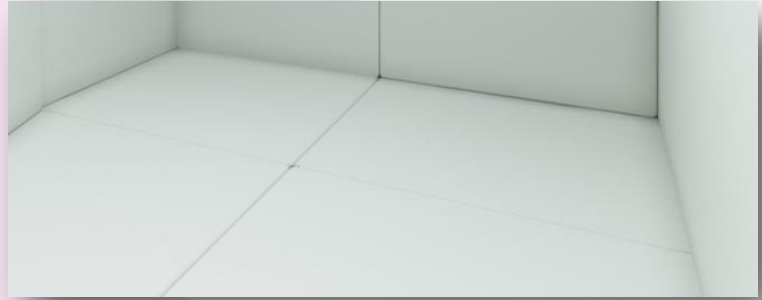
1 x Soft Floor Padding (quantity as per your room size, survey may be required)