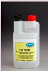
1 x BCB Bubble Wall Additive