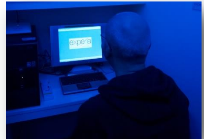
1 x Hi Spec Computer & IRiS Computer Interface