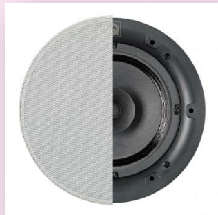
1 x Bluetooth Recessed Speakers (if ceiling allows)