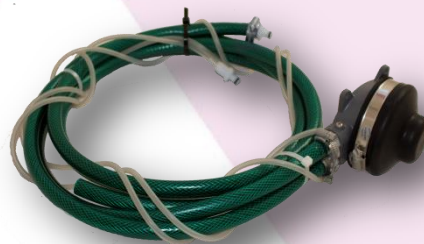
1 x Bubble Wall Emptying Kit with footpump