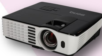
1 x Video Projector & Ceiling Bracket (model may vary)