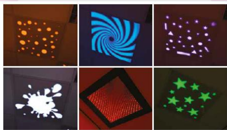
6 x IRiS LED Ceiling Tiles (we recommend six matching shapes from a choice of: Circles; Swirl; Mixed Shapes; Splash; Infinity tunnels; or Stars)