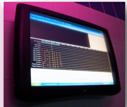
1 x Touchscreen & Wall Bracket 1 x Room Director Software