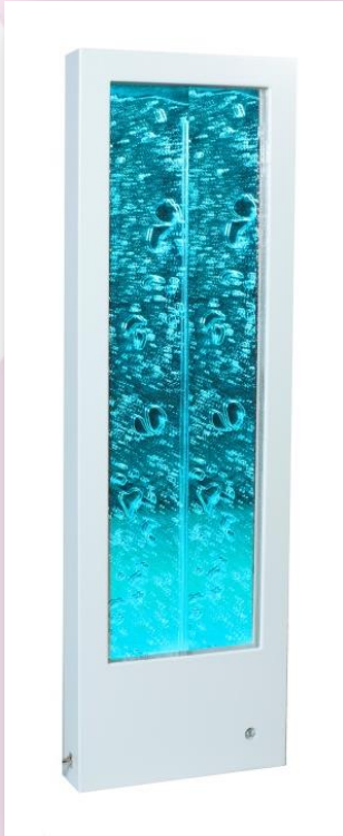
1 x IRiS LED Bubble Wall