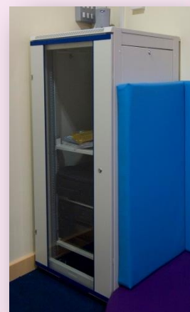
1 x Control Cupboard