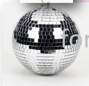
1 x Mirror Ball & Motor