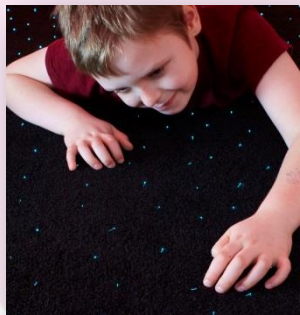
1 x Calming Fibre Optic Carpet 2m x 1m