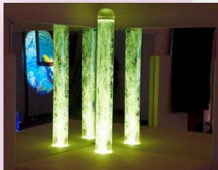
2 x Acrylic Mirrors