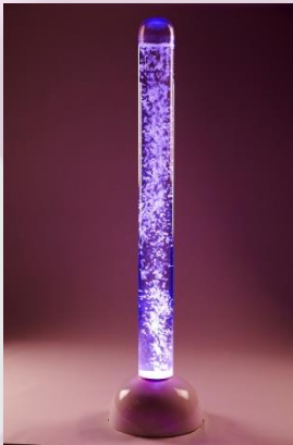
1 x Calming LED Bubble Tube (1.5m)