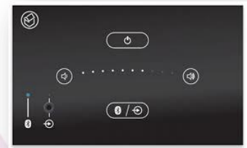
1 x Bluetooth Amplifier