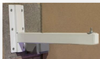
3 x Wall Brackets