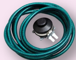
1 x Bubble Tube Emptying Kit with foot pump