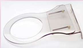
1 x Bubble Tube Bracket