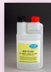
1 x BCB - Bubble Tube Additive