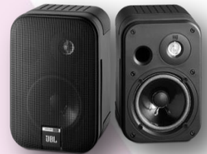
1 x Pair Wall Speakers