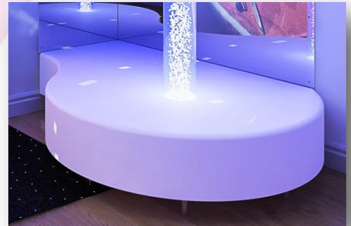
1 x Shaped Bubble Tube Plinth