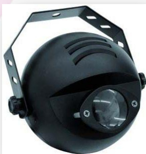
1 x Calming RGB Pin spot