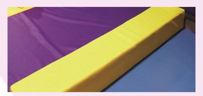
1 x Soft Kerb (dependent on room size, survey may be required)