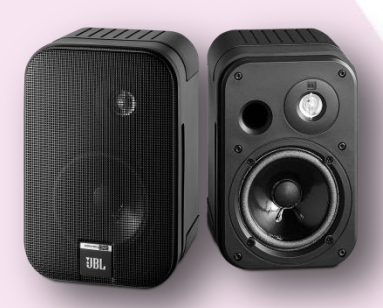
1 x Pair of Wall Speakers