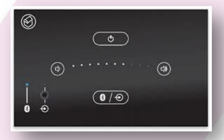
1 x Bluetooth Amplifier