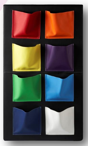
1 x Shoe Sorter