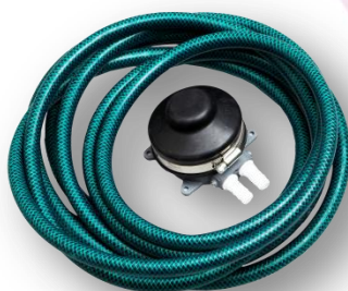
1 x Bubble Tube Emptying Kit with foot pump