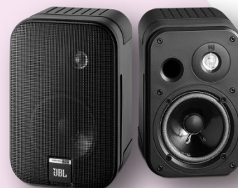
1 x Pair Wall Speakers