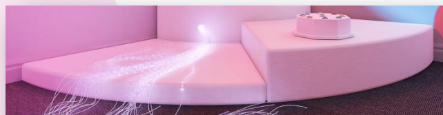
2 x Soft Floor Pads - Multi-tier