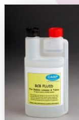
1 x BCB - Bubble Tube Additive