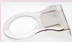
1 x Bubble Tube Bracket