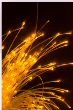
1 x Calming Fibre Optic Strands