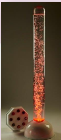
1 x Superactive LED Bubble Tube - 1.5m