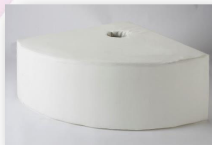
1 x Curved Bubble Tube Plinth (900 x 900 x 400mm)